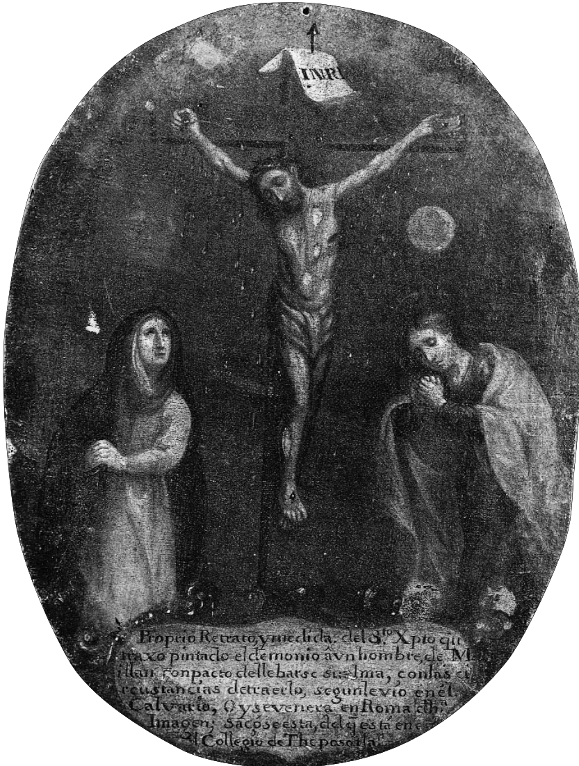
3. Artist unknown, Crucifixion with the Virgin and St. John, 18c. Virginia Historical Society, Weddell Collection, Richmond, Virginia, USA.