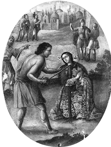
2d. Artist unknown, Death of St. Agnes, from Episodes from the Martyrdom of St. Agnes, 18c. Virginia Historical Society, Weddell Collection, Richmond, Virginia, USA.