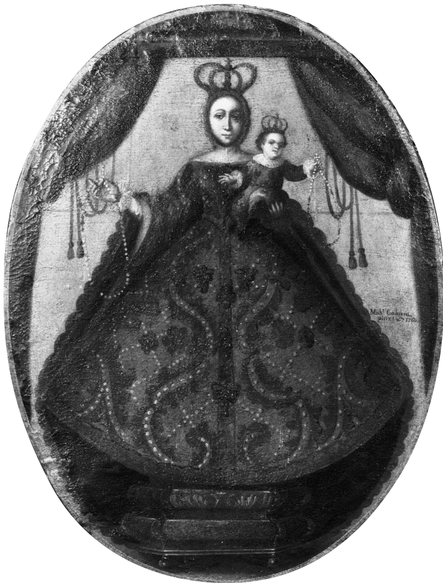
6. Miguel Cabrera (?), Virgin of the Rosary, 1760. Virginia Historical Society, Weddell Collection, Richmond, Virginia, USA.