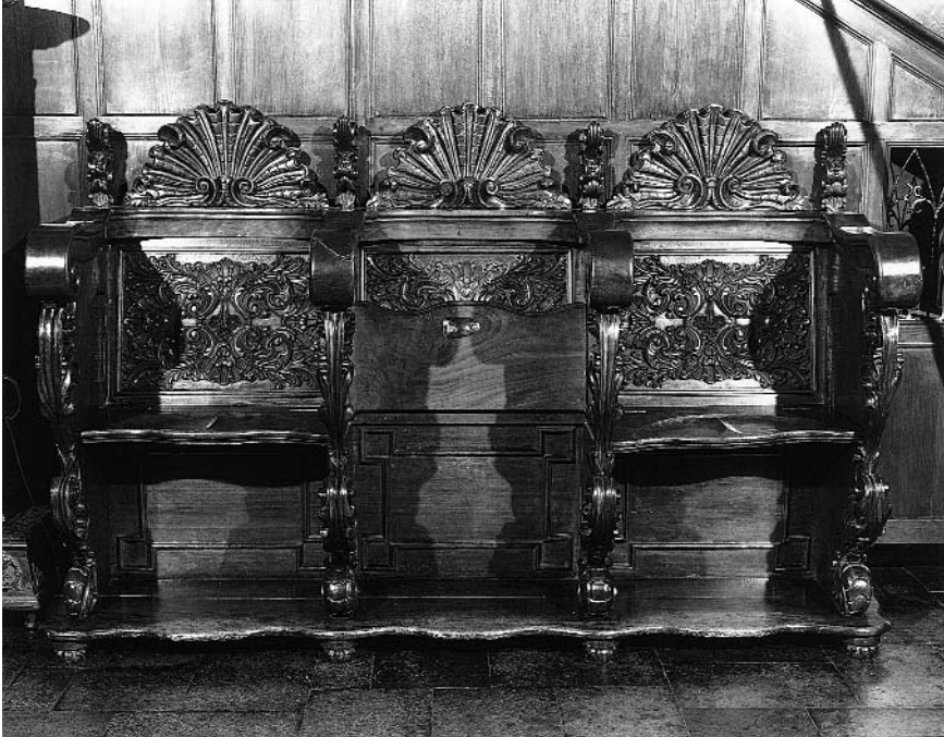
9. Choir stall, c. 1700-1730. Virginia Historical Society, Weddell Collection, Richmond, Virginia, USA.

the couple was in possession of the stalls by October of 1926, when they had them packaged and shipped from Mexico City to Richmond. 49