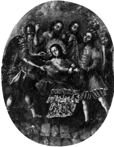
2a. Artist unknown, Imprisonment of St. Agnes, from Episodes from the Martyrdom of St. Agnes, 18c. Virginia Historical Society, Weddell Collection, Richmond, Virginia, USA.