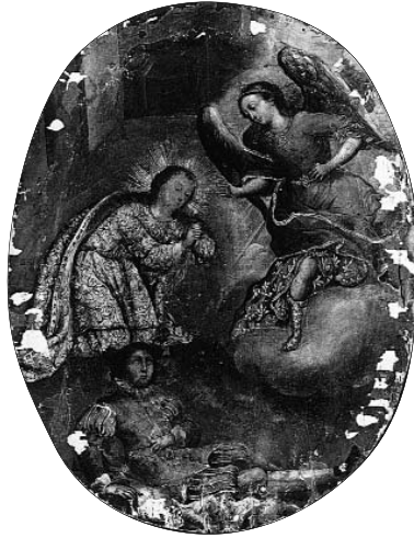
2b. Artist unknown, St. Agnes and an Aggressor, from Episodes from the Martyrdom of St. Agnes, 18c. Virginia Historical Society, Weddell Collection, Richmond, Virginia, USA.