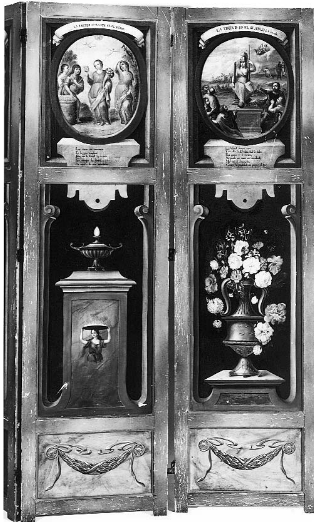
8. Artist(s) unknown, Biombo with Emblems from Otto van Veen's Horatii Emblemata, 18c. Virginia Historical Society, Weddell Collection, Richmond, Virginia, USA.