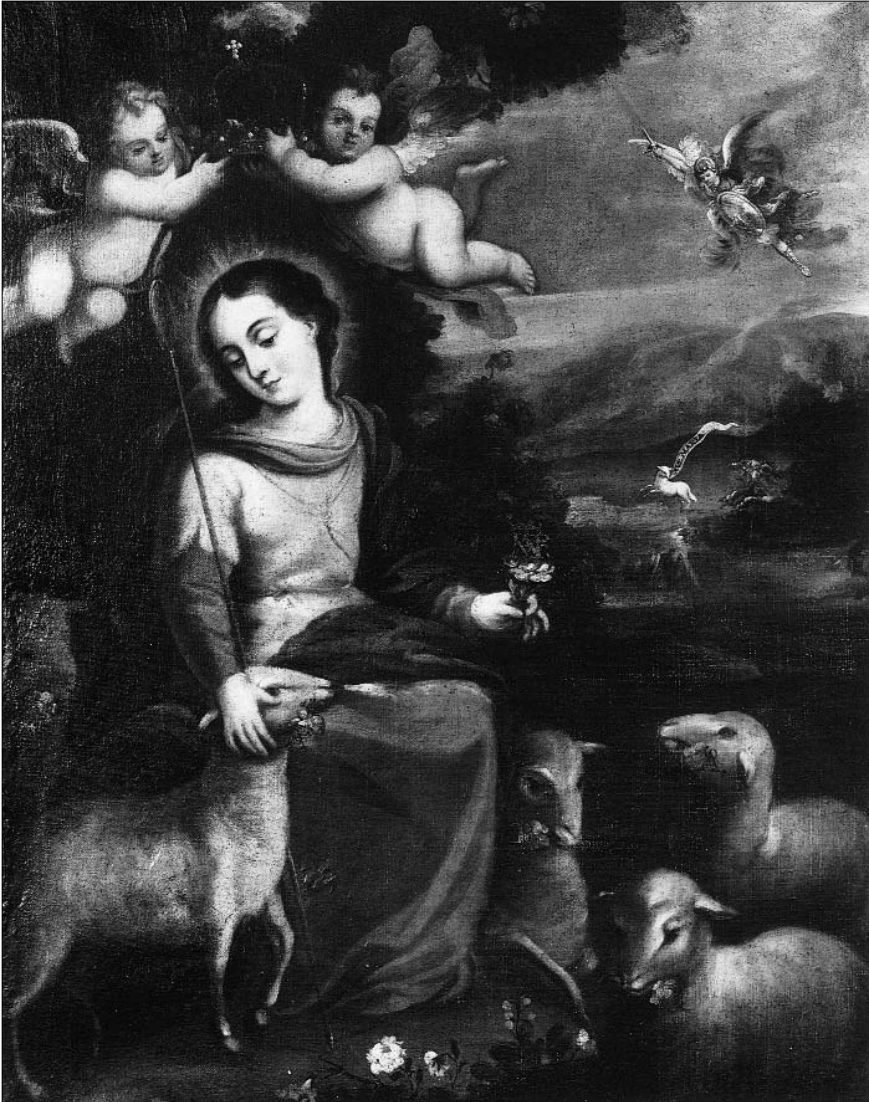
4. After Miguel Cabrera, Divine Shepherdess, 18c. Virginia Historical Society, Weddell Collection, Richmond, Virginia, USA.