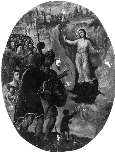
2c. Artist unknown, St. Agnes on the Pyre, from Episodes from the Martyrdom of St. Agnes, 18c. Virginia Historical Society, Weddell Collection, Richmond, Virginia, USA.