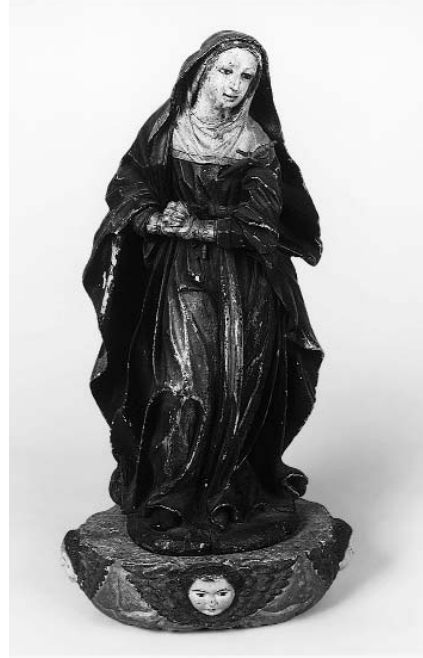
10. Virgin of Sorrows, 18c. Virginia Historical Society, Weddell Collection, Richmond, Virginia, USA.

Her heart is pierced with a small, wooden dagger made of a separate piece of wood, which appears to be of distinct, possibly later manufacture than the sculpture itself. The faint remains of elaborate, gold patterning are visible on the back of the figure, thus suggesting that it may have originally borne extensive estofado on its robes. The date “MDXXV” (1525) is carved into the figure near her feet.