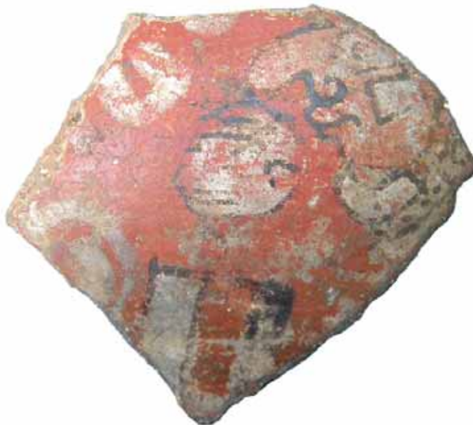
12. Banderas sherd with a depiction of Ek Chuah. Provenience: Acropolis, CH08-70, base of wall of upper terrace of Western Terraces.

Animal representations are uncommon, save for the highly stylized Quetzalcóatl, although a huacal in the Peabody Museum of Harvard University, in a variant Banderas Polychrome substyle, seems to depict a coyote. 17 To date representations of humans are rare, although one depicting a very long-nosed individual has been excavated and compared with the “Nose Gods” Ek Chuah and Yacatecuhtli, god of merchants and spies. Thus reinforcing our ideas concerning the importance of far-flung trading ties between Cihuatán and Mexico (fig. 12). 18