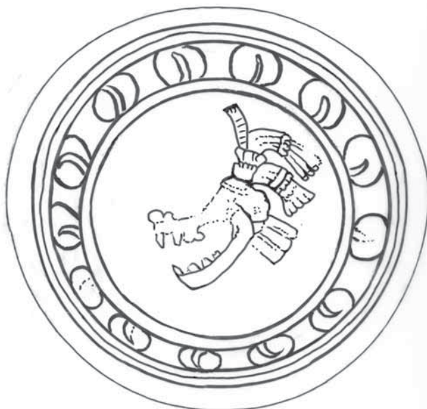
14. A small rounded bowl or plate with the head of a long-jawed skeletal supernatural creature. Currently in the collection of the Museo Universitario de Antropología, Universidad Tecnológica de El Salvador, San Salvador.

same contexts as a plethora of other decorated wares including a series of local polychromes, Nicoya Polychrome, a local version of Fondo Sellado , and the plumbates.