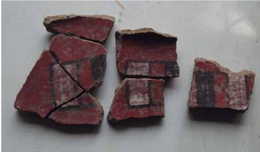
3. Fragments of a large serving bowl of the Banderas Sencillo substyle excavated in the palace of the Acropolis (CHO5-56, units 4 and 8, level 1).