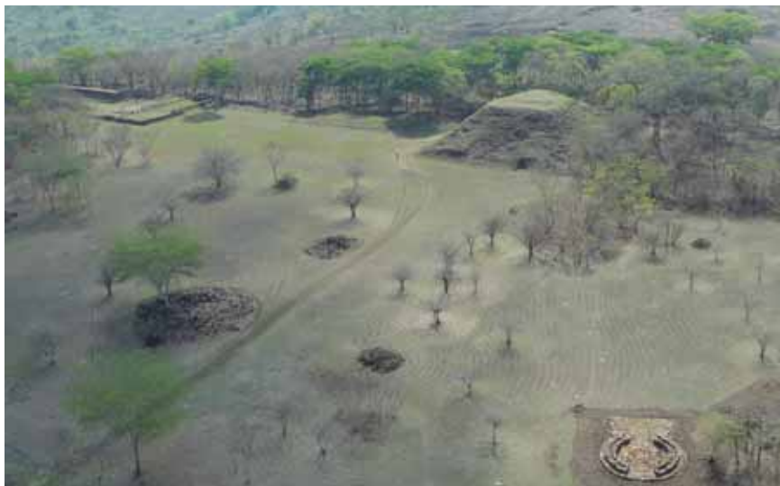
1. A helicopter view of the Ceremonial Center of Cihuatán with the Acropolis excavations visible at the top of the photograph.

East, although on higher ground than the Ceremonial Center, is the Acropolis (fig. 2). Ongoing investigations here have uncovered a series of residential and ritual structures, including a central Mexican tecpan style palace, presumably the living quarters of the rulers of Cihuatán. We do not know who the rulers of Cihuatán were, their origin, or their ethnicity. A possibility is that they were highland Guatemalan or Salvadoran Maya who had absorbed the new elite culture which arose after the Late Postclassic political collapse and were using it to set themselves off from the Classic period rulers. Another possibility is that they were Mexicans who originated in one of the regions strongly affiliated with the new traditions of the Postclassic, as were Puebla and Veracruz. Whoever they may have been it seems very unlikely that they were the ancestors of the historic Pipil, even if the latter were, ultimately, of Mexican origin. 5 This new ruling elite seems to have been either very power-