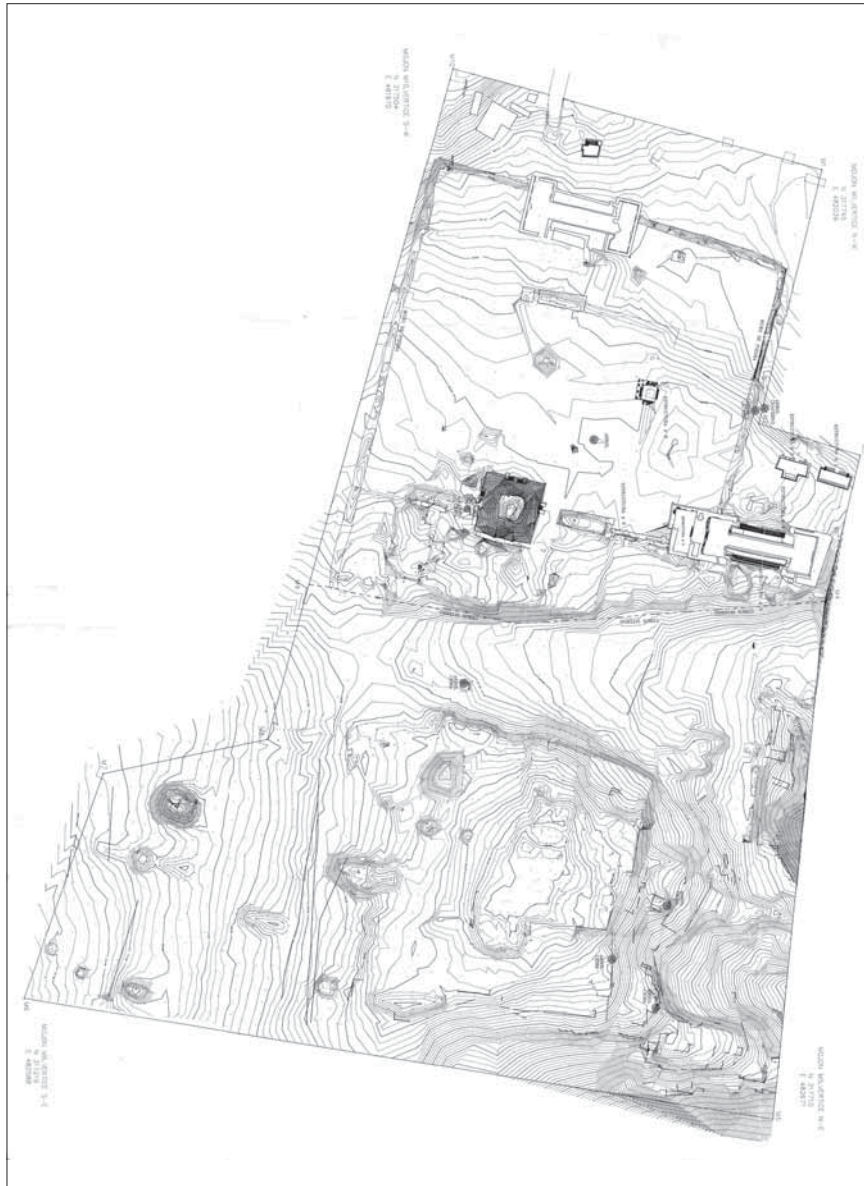
2. Plan of Cihuatán showing major structures and their relationships. The Ceremonial Center, the Acropolis, and environs. Drawing: APSIS, courtesy of FUNDAR.