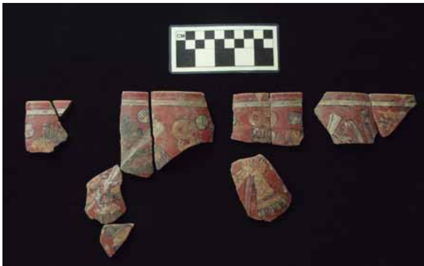
10. "Eagle vase" from the Acropolis Palace. Provenience: CHO-64 and allied contexts.

Blood spotted crossed bones and flying rib cages are likewise common motifs that suggest warfare and sacrifice (figs. 6b and c). Dismembered body parts also refer to customs of dismemberment of sacrificial victims better known from Late Postclassic Central Mexico (fig. 9).