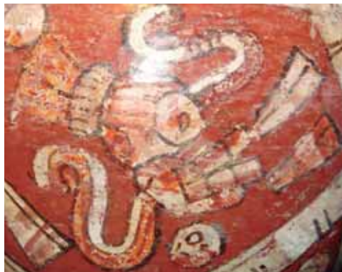
6. Banderas chalice with depictions of (a) crossed bloody bones and crossed space dividers (b) a bloody rib cage, and (c) detail of a skull with the temillotl hairdo and blood flowing from the neck region. All designs also include eagle-down balls, and maguey spines. Height 15.7 cm. Provenience unknown. Private collection, San Salvador, El Salvador.