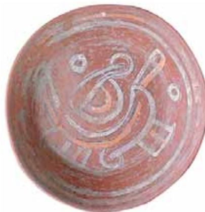
7. Flat bottomed bowl with a schematic feathered serpent design as the tondo. Provenience unknown. Private collection, San Salvador, El Salvador.

highly developed cultures of southern Mexico (in the arts) need to be carefully examined for their specific contributions to what, some 400 plus years after the depiction of the temillotl in Salvadoran Banderas Polychrome ceramics, became an important insignia of rank in the Valley of Mexico (fig. 6c).