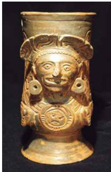
11. Tohil Plumbate vase with a figure wearing a pendant. Provenience unknown. Private collection, San Salvador, El Salvador.

Another motif, and one which places Banderas Polychrome firmly in the Early Postclassic Period is a pendant or necklace identical to those represented on Tohil Plumbate ceramics (fig. 11). Tohil Plumbate is, of course, the hallmark of the Early Postclassic, appearing at the beginning of that epoch and disappearing sometime shortly before AD 1200. Tohil Plumbate is common in all contexts at Cihuatán, and Banderas Polychrome has been found in situ with Tohil Plumbate at that site.