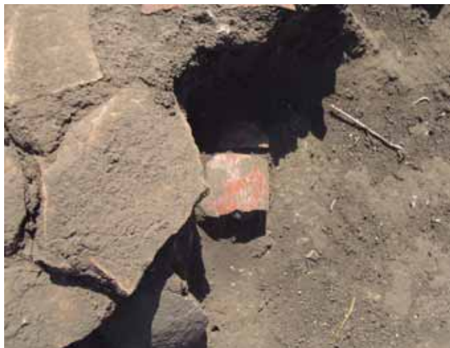
5. Banderas sherds in situ in the Acropolis palace, unit 3, level 2.

Although from looted examples we can delineate several subvarieties of Banderas Polychrome, the Banderas Polychrome vessels from Cihuatán are almost entirely of a single type which we call Banderas Codex. 10 These vessels have a highly polished red background with motifs clearly related to, derived from, or ancestral to, those of southern Mexico. Unfortunately, we have only a very small comparative sample of excavated and published Early Postclassic Mixteca-Puebla Polychrome from southern Mexico and it is not very similar. Banderas ceramics, for example, lack the elaborate step fret designs characteristic of the Mexican ware. In fact, Banderas iconography is quite limited and ignores many of the common themes of Cholula, being, in some ways, more central Mexican in content. This immediately raises questions as to how such a developed iconography was introduced, especially since no genuine pieces