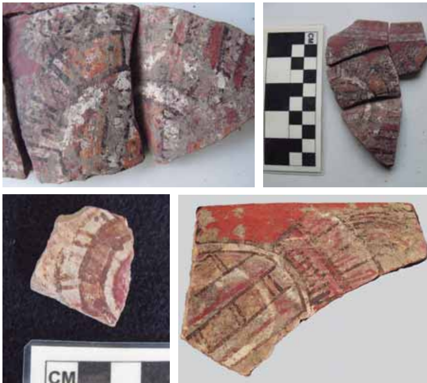
13. Sherds of several vessels from the Acropolis of Cihuatán showing variants of the chimalli design. (a) This piece seems to be an intermediate style between Copador and Salua and Banderas Polychrome. Provenience unknown. Private collection; whereas (b) and (c) are sherds of Banderas chalices excavated in the Acropolis Palace.

Excavations both in the monumental center and in the surrounding residential neighborhoods have revealed that people simply fled, or perished, leaving their belongings where they were using them to be crushed on the floors by the falling walls and roofs of the buildings. Spear points are commonly found in the burned layers and the only human remains we have encountered in the Acropolis excavations were male crania (and a humerus), caught in drains and obviously pertaining to the violent end of the city.