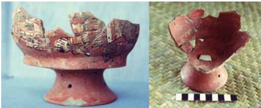
4. A small Banderas cup with a chimalli design found as a dedicatory offering buried in the center of the floor of Structure ss-50 in 1977.