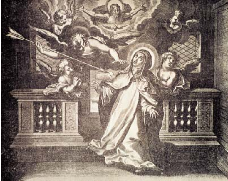
Figure 6. Adriaen Collaert and Cornelis Galle, Transverberation of St. Teresa , 1613.

colonial period, when certain contemporary deaths were perceived as cases of martyrdom. In addition to the martyred children of Tlaxcala mentioned previously, there was a cult surrounding the Franciscan missionary St. Philip of Jesus, a native of Mexico City, who in 1570 was crucified in Japan with twenty six other friars, deacons, lay people, and Japanese tertiaries. This event was depicted in New Hispanic art, including a series of murals in the Franciscan church at Cuernavaca. The Jesuit Order also claimed to have contributed martyrs to the Church's missionary effort. Between 1594 and 1734, thirteen members of the Order were killed while propagating the faith at missions in Northern Mexico. 32