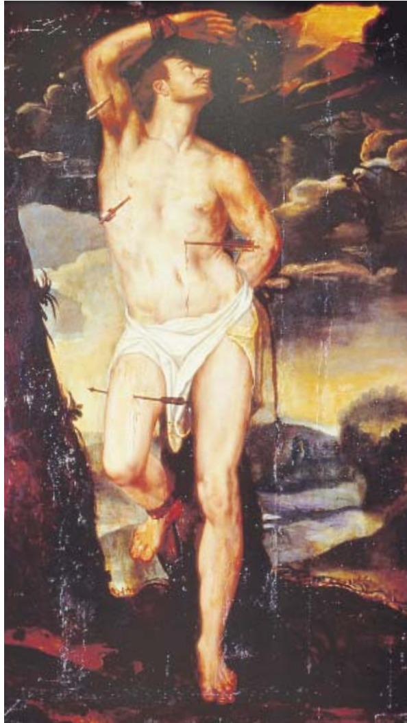
Figure 7. Attributed to Baltasar de Echave Orio, St. Sebastian , 16 th century, formerly Cathedral of México, until destroyed by fire in 1969.