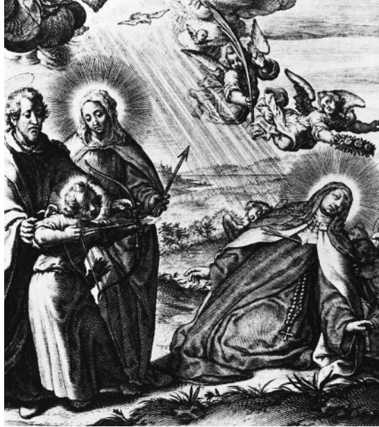
Figure 4. Anton Wierix, Transverberation of St. Teresa with the Holy Family , early 17 th century.