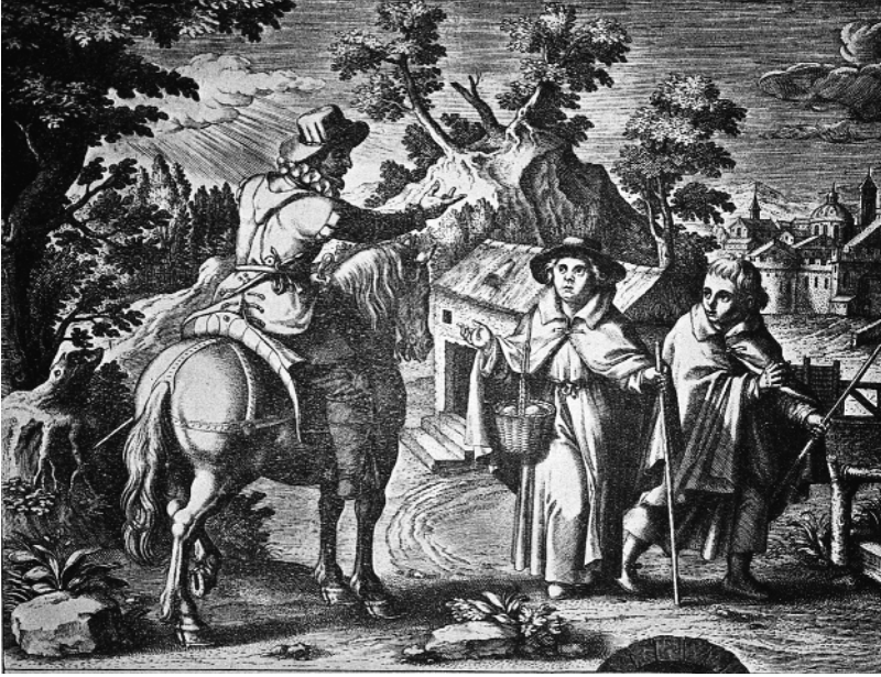
Figure 2. Adriaen Collaert, St. Teresa and Her Brother Rodrigo on Their Way to the Land of the Moors , 1613.

efforts to combat heresy and save souls. By remaining occupied in prayer for priests and defenders of the faith —those on the front lines of the Church’s militant offensive— “we shall be fighting for Him [God] even though we are very cloistered.” 12 And though they might not die at the hands of infidels, Teresa assures her nuns that the austerities practiced in each of her houses —poverty, silence, enclosure, penance— can lead to an interior death which is nothing less than “a long martyrdom.” 13 Trials and illnesses should be welcomed, since they serve as catalysts in this process of dying. Teresa sums up the attitude to be adopted by the Discalced Carmelite nun: “Be determined, Sisters, that you came to die for Christ, not to live comfortably for Christ.” 14