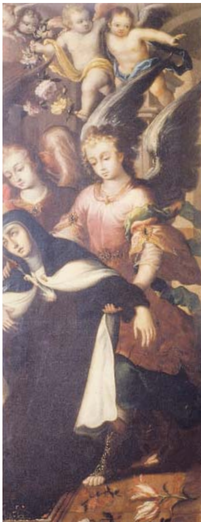
Figure 12. Juan Correa, Transverberation of St. Teresa , late 17 th early 18 th century, Museo Nacional de las Intervenciones, Churubusco.