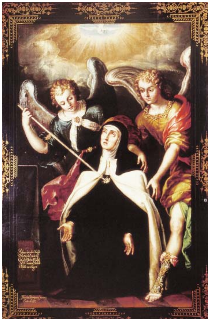
Figure 11. Nicolás Rodríguez Juárez, Transverberation of Saint Teresa , 1692, Museo Nacional del Virreinato, Tepotzotlán.