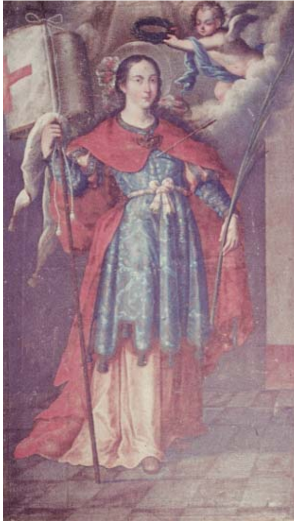
Figure 10. Juan Correa, Saint Ursula , late 17 th early 18 th century, Convento de San Francisco, Ciudad Vieja, Guatemala.