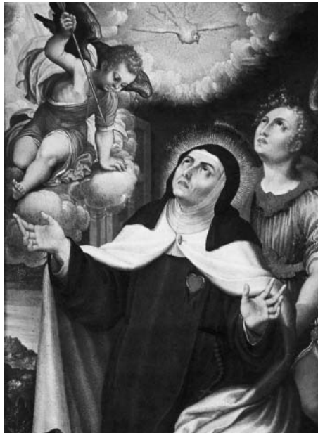
Figure 5. Alonso López Herrera, Transverberation of St. Teresa , first half 17 th century, Private Collection, México City.