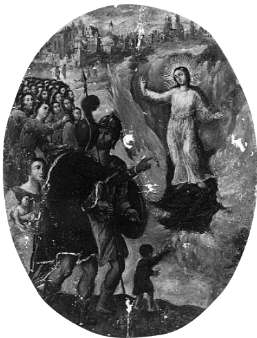
2c. Artist unknown, St. Agnes on the Pyre, from Episodes from the Martyrdom of St. Agnes, 18c. Virginia Historical Society, Weddell Collection, Richmond, Virginia, USA.