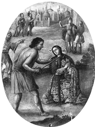
2d. Artist unknown, Death of St. Agnes, from Episodes from the Martyrdom of St. Agnes, 18c. Virginia Historical Society, Weddell Collection, Richmond, Virginia, USA.