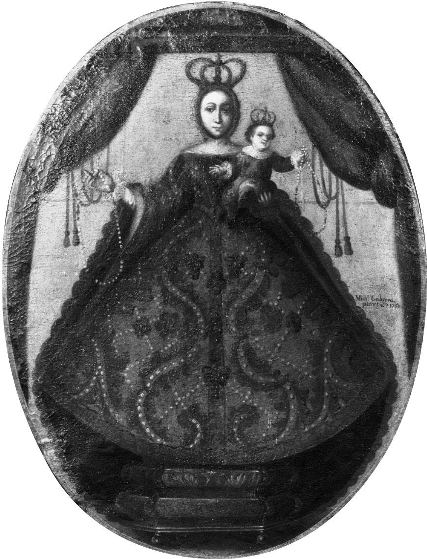
6. Miguel Cabrera (?), Virgin of the Rosary, 1760. Virginia Historical Society, Weddell Collection, Richmond, Virginia, USA.