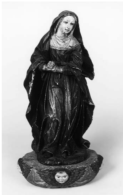
10. Virgin of Sorrows, 18c. Virginia Historical Society, Weddell Collection, Richmond, Virginia, USA.

Her heart is pierced with a small, wooden dagger made of a separate piece of wood, which appears to be of distinct, possibly later manufacture than the sculpture itself. The faint remains of elaborate, gold patterning are visible on the back of the figure, thus suggesting that it may have originally borne extensive estofado on its robes. The date “MDXXV” (1525) is carved into the figure near her feet.