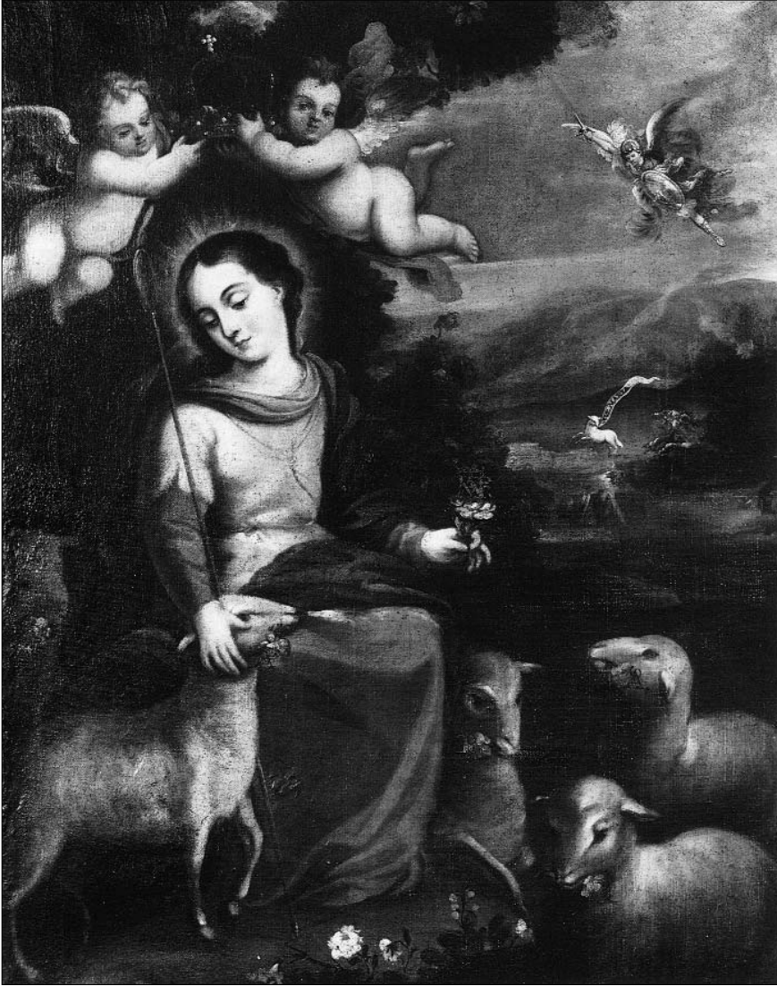
4. After Miguel Cabrera, Divine Shepherdess, 18c. Virginia Historical Society, Weddell Collection, Richmond, Virginia, USA.