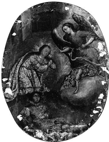
2b. Artist unknown, St. Agnes and an Aggressor, from Episodes from the Martyrdom of St. Agnes, 18c. Virginia Historical Society, Weddell Collection, Richmond, Virginia, USA.