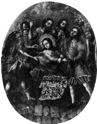
2a. Artist unknown, Imprisonment of St. Agnes, from Episodes from the Martyrdom of St. Agnes, 18c. Virginia Historical Society, Weddell Collection, Richmond, Virginia, USA.