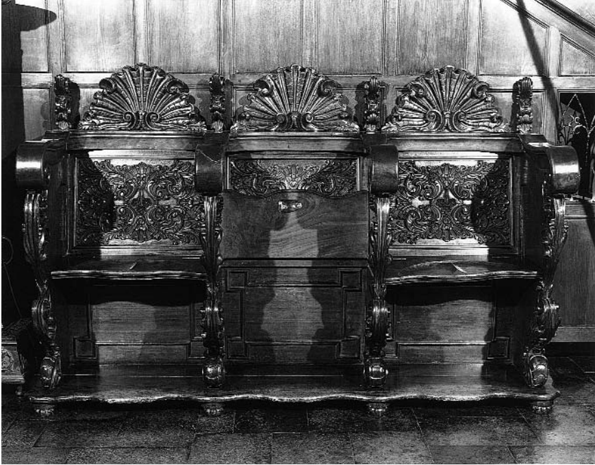
9. Choir stall, c. 1700-1730. Virginia Historical Society, Weddell Collection, Richmond, Virginia, USA.

the couple was in possession of the stalls by October of 1926, when they had them packaged and shipped from Mexico City to Richmond. 49