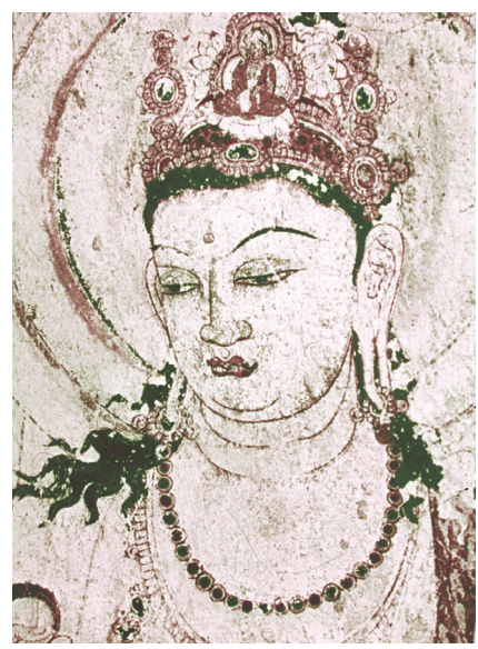
6. Amida Paradise (details), Wall 6, Horyu-ji Kondo, Nara.

taken before they were damaged show what a precious cultural asset was lost to the world. The paintings portrayed three Buddhas—Shaka, Amida (fig. 6), and Yakushi—each in its own paradise. While the same type of outline is used for each of the images, the brushwork differs subtly. Although linear and planar in approach, they are by no means lacking in a sense of three-dimensional plasticity. The faces of the twelve disciples of Shaka portrayed in the mural each express intelligence and integrity. Although the basic technique seen here can be thought of as an import from Tang China, these paintings in their entirety are imbued with a unique sense of vitality that places them squarely in the Japanese artistic tradition.