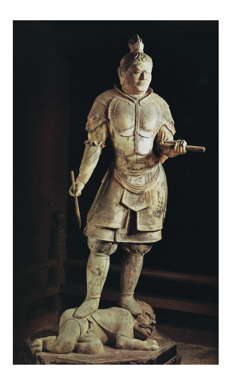
3. K. Kimimaro, Kōmokuten , Todai-ji, Kaidan-in, Nara.

blances have been noted between the size of the figures, the composition of the clay, and the coloring technique, leading to the proposition that they might originally have been located in the same worship hall. In terms of artistic effect, the simultaneous expression of stillness and movement characteristic of both these masterful groups of figures binds them stylistically. To examine these similarities in greater detail, let us first focus on Kōmokuten (fig. 3). The narrowed eyes of this image, gazing vigilantly into the distance under knitted brows, reveal the key characteristic we have noted in the two aforementioned images: the lines of both the upper and lower lids bow downward in the middle. Furthermore, both the modeling of the cheeks and the overall proportions of the face are nearly identical to those of Gakkō . Add to these similarities the narrow forehead and the rim of locks bordering it, the hair done up in a topknot, and the shape and size of the ears—all common to both images—and one cannot but conclude that a single artist was responsible for these sculptures. One can also confirm the likeness between the features of