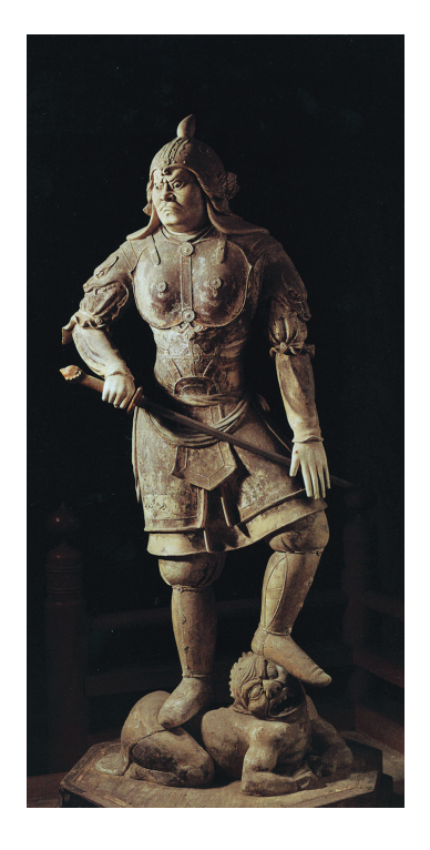
4. K. Kimimaro, Jigokuten , Todai-ji, Kaidan-in, Nara.

this Kōmokuten image and those of the incised images on the lotus-petal pedestal of the Daibutsu (fig. 5). Despite the contrasting expressions of serenity and anger, the eyes, the delineation of the base of the nose, and the outline of the lips are all similar, strongly suggesting that they follow the drawings of a single artist.