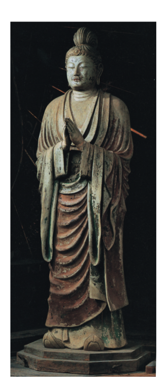
K. Kimimaro, Nikkō-Bosatsu, Todai-ji, Sangatsu-do, Nara.

The images of Nikkō and Gakkō bodhisattvas in the Sangatsu-do hall of the Todai-ji temple (figs. 1, 2) share the distinctive eye shape. In my opinion these two images are among the very best examples of Tenpyo sculpture of the Classical period: the fullness of their faces, their aura of divinity, and the natural quality of their reverent poses elevate them above the merely human even while preserving a feeling of humanity. I would go a step further and suggest that these are idealized androgynous images, with the gentle hint of a smile suggesting a maternal quality. The preference for feminized bodhisattva images stems from the same emotional and spiritual impulses that underlie the popularity of images of the Virgin Mary in the West. It is an expression of people's need to incorporate the element of maternal love and compassion in their concept of divinity. The characteristically slanted eyes, with their gently bow-curved eyelids, enhance the realism of these feminine faces, and the firm mouth conveys a sense of living, human flesh. At the same time, when viewed directly from the front, these faces closely resemble those of the incised Shaka images on