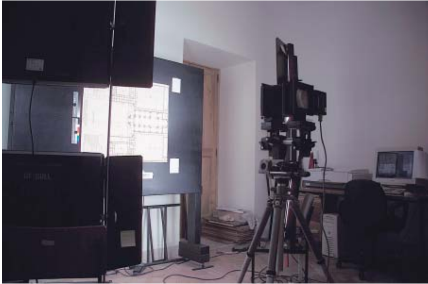
3. Scanning original drawings in high resolution at the Bibliotheca Hertziana in Rome. The whole digitalization-system is mobile and was already used for scan-campaigns in Milan and Berlin.

intended for studies in the humanities: the XML diagram guarantees data exchange among different installations. ZUCCARO constitutes the basis for the cooperation between the two data base projects of the Bibliotheca Hertziana, Lineamenta and ArsRoma (painting in Rome 1580-1630).