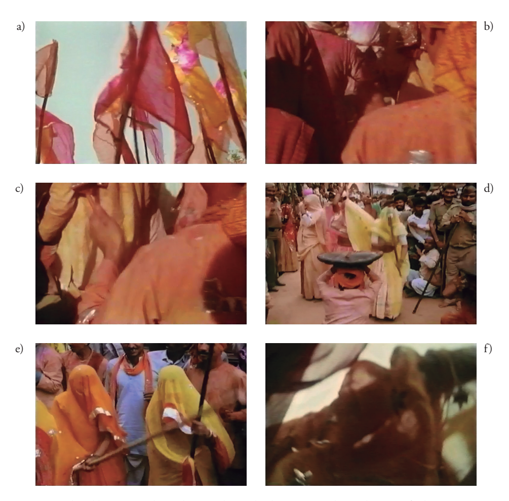
6a). Colored banners in the Holi Festival in India; b, c) camera shows closeups of pilgrims wearing colored clothes during their ascent to the temple of the village of Nandgaon; d-f) veiled women of the village of Barsana (actually but symbolically) beating men with long bamboo sticks. Filmstills taken from Beeche, Holi: A Festival of Color. A Hindu Celebration (vid supra n. 67).