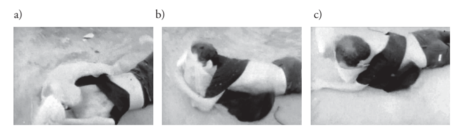
2a-2c). Hélio Oiticica, Parangolé P17 Cape 13 "I am Possessed" , 1967. Filmstills taken from Cardoso, Heliorama (vid supra n. 6).

banda religion. <sup>16</sup> The dances during the rites of the Orixá cult resemble the Samba; it is all about trance, in so far as the "possession trance" plays an important role. Then, the persons in trance receive a white bandeau, called oja , wound around the upper part of their bodies and they wear oxu , a conical pack of ingredients that protect the sacred cuts received during the initiation rite. The priest or priestess is considered to function in a creative capacity causing the novices' birth. In this sense, art historian Mikelle Smith Omari describes the procedure as follows: