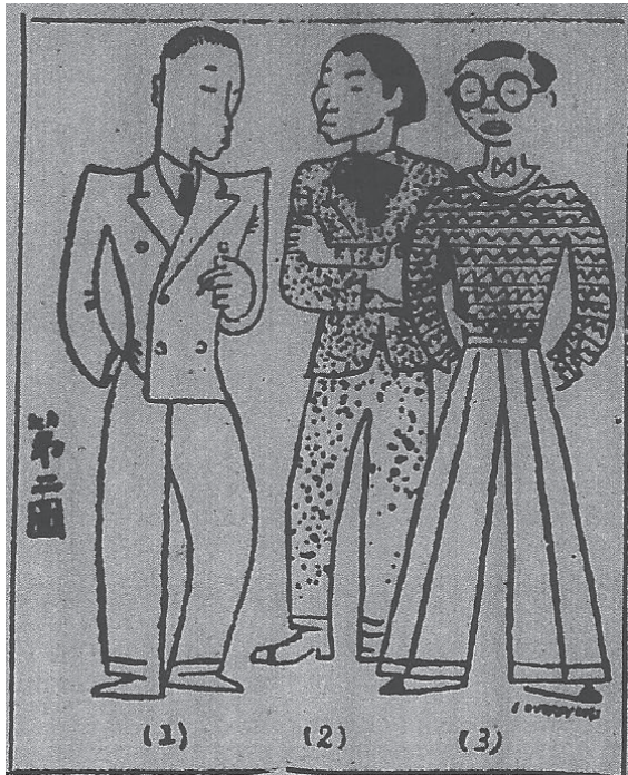
4. Anonymous copy of a drawing by Covarrubias, ( Three Chinese students ), The Analects , January 1, 1931.