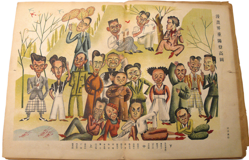
2. Wang Zimei 汪子美, "Jinghu manhuajie 京滬漫畫界 (The Cartoon Circle of Nanjing and Shanghai)," in Shanghai manhua 上海漫畫 ("Shanghai Sketch"), no. 6 (10 October 1936).

cartoonists, as well as in their capacities as fashion designer and furniture designer, respectively (see fig. 2).