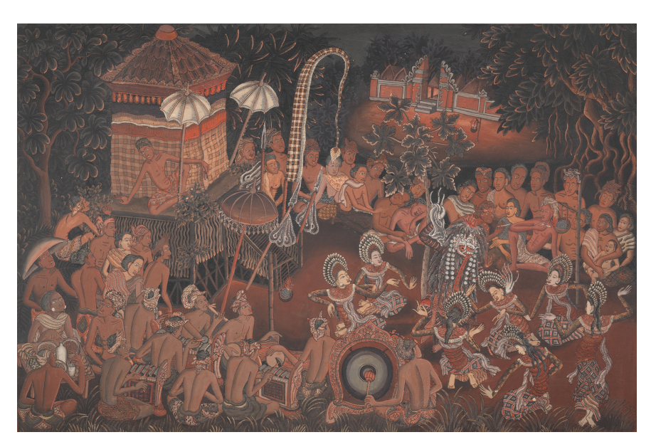
3. I Dewa Gede Sobrat (b. 1912 or 1917 - d. 1992), Calon Arang , c. 1937, ink and paint on wood, 65.1×95.9 cm, Fowler Museum at UCLA; X74.L375, Anonymous donor.

image by the same artist, and later there is a depiction of a shadow play performance by Ida Bagus Made Nadera. <sup>14</sup> Some of Covarrubias's other illustrations were copies of drawings from Balinese paintings or palm-leaf manuscripts, including the offending naked woman mentioned by Pollmann. <sup>15</sup>