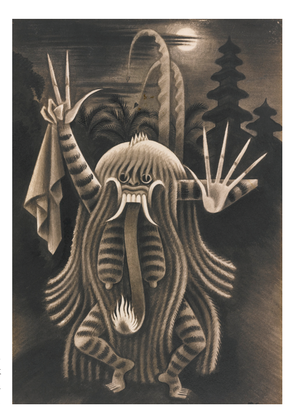
5. Miguel Covarrubias, Rangda , 1937, graphite, charcoal and ink on paper, 38×25 cm, Museum Pasifika, Bali.

interest and should have a quite large and continuous sale." This prediction was very accurate.