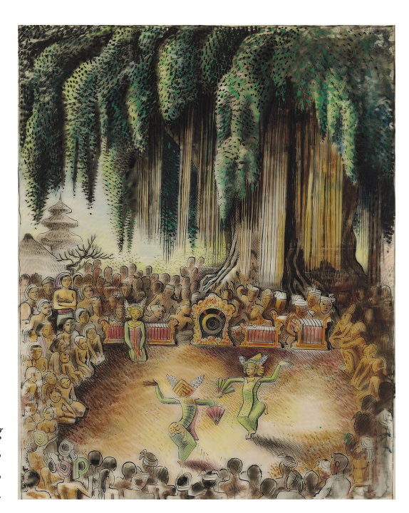
2. Miguel Covarrubias, Legong Performance under a Banyan Tree, gouache on paper, 48.2 × 38.1 cm, Museum Pasifika. Bali.

undesirable influences from them, and helping them to sell their work in the museum of Den Pasar, a clearing-house where only pictures of high quality are exhibited.<sup>9</sup>