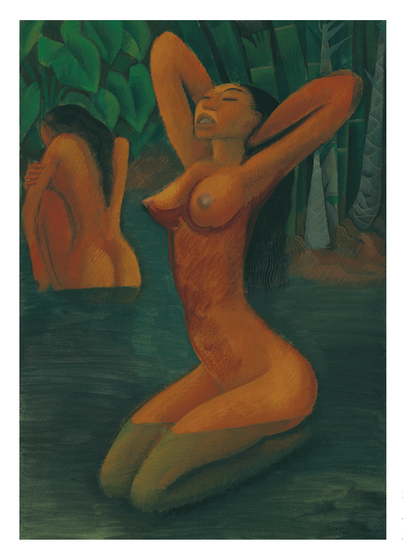
Miguel Covarrubias, Two Girls Bathing, oil on canvas, 67 × 52 cm, Museum Pasifika, Bali.