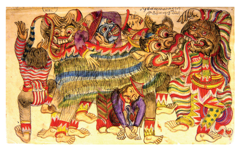
2. I Ketut Gedé, A Barong Performance, ca. 1880, polychrome, watercolours and ink, bottom part of folded sheet 43 × 34.5 cm, Singaraja, Bali. Special Collections Leiden University ms Or. 3390:125.

the Barong represent the female monster léak and the one with the blue mask a male demon. In the foreground a spectator is depicted in the act of ngurek : stabbing himself with a kris during trance.<sup>24</sup> Van der Tuuk gives the following description in his Kawi-Balinese-Dutch-Dictionary, volume IV: " barong : a certain masked performance, white hair, face of wild animal. The sekaa barong ['barong collective'] is also engaged in ngurek ."