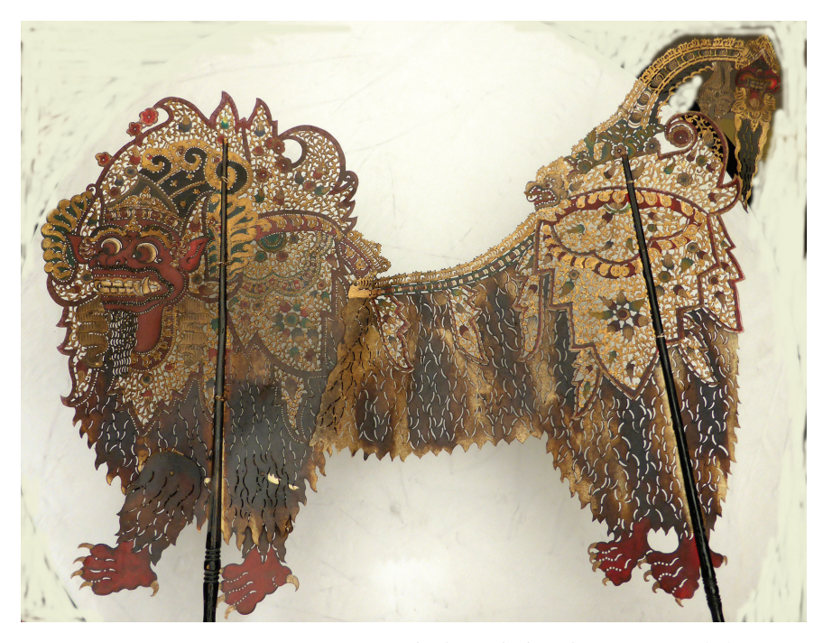
I. I Wayan Wija, Contemporary Barong Figure of Balinese Shadow Theatre , 2017, cowhide, 60×30 cm, Ubud, Bali.

ethnographers fascinated by the Barong figure and that is why it has been chosen as main focus of this article in order to explain cultural political developments in Bali at the end of the colonial times.