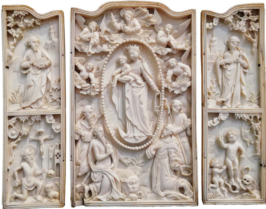
7. Triptych The Virgin of the Rosary with the Christ Child and Saints, ivory relief made in the Philippines by a Sangley craftsman, early 17 th century

Concerning the Franciscan ascetic and eremitical tradition, the active and contemplative lives are two attitudes which have been developed within Christian spirituality. Both are linked to the salvation of the human being, but through different methods. As for the mendicant orders, their preaching campaigns are often emphasized in contrast to the monastic orders. However, Franciscan asceticism and contemplative exercises date back to the time of Francis of Assisi. Eremitical practice among Francis and his followers has been studied by several authors. 89 The Regula pro eremitoriis data (Rule for hermitages) by Francis of Assisi shows the importance of balance in active and