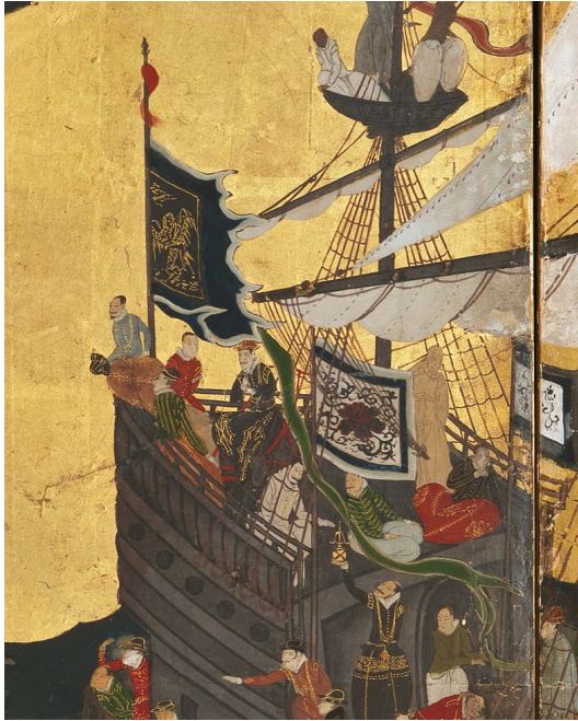
5. Kano Naizen, Nanban screen, detail, 1593-1601. Museu Nacional de Arte Antiga.

The Virgin of the Rosary with the Christ Child and Four Holy Hermits (fig. 6) now belonging to the Sendai City Museum is an oil painting brought to Japan by Hasekura Tsunenaga (1571-1622), who led a diplomatic mission to Spain and the Vatican, traveling via New Spain, between 1613 and 1620. This work is linked to the Franciscan rosary because the founder of the Seraphic Order appears as one of the four holy hermits in the lower part of the painting.