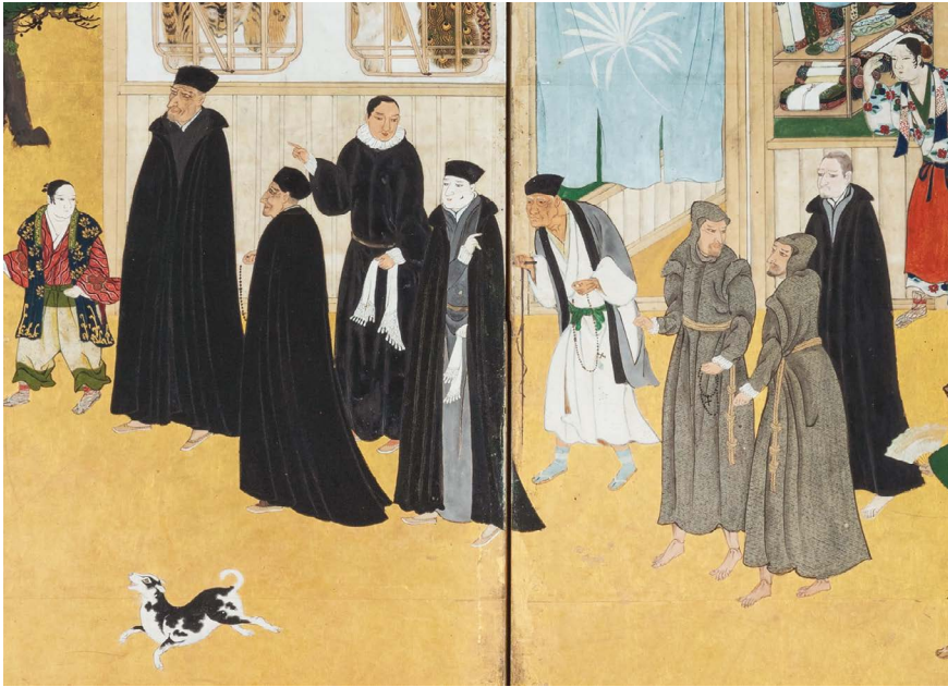
1. Kano Naizen, Nanban screen , detail, early 17 th century, © Kobe City Museum.

hands. 51 Similarly, Jesuit and Franciscan missionaries and Japanese Christians are depicted with a rosary in their hands in Nanban folding screens attributed to Kano Naizen (1570-1616) and now belonging to the Kobe City Museum (fig. 1) and the National Museum of Ancient Art in Lisbon. 52 Great fervor for blessed rosary beads, particularly among the Japanese was reported in different missionary sources. Wearing a rosary around the neck was regarded as “the greatest sign of being Christian.” 53