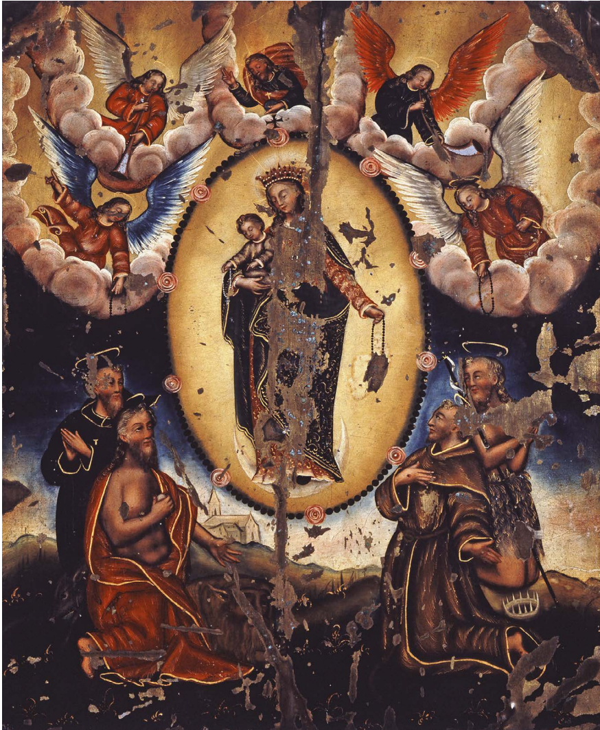
6. The Virgin of the Rosary with the Christ Child and Four Holy Hermits , oil painting on metal plate, early 17 th century.