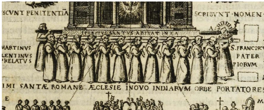
2. Diego de Valadés, Rhetorica christiana (Perugia, 1579), detail of the illustration showing the activities carried out in the atrium of the Franciscan convent of New Spain.

his Historia eclesiástica indiana (written around 1595, first published in 1870), the Franciscan missionary Jerónimo de Mendieta (1525-1604) mentions that the Indians brought beads to pray, and then took them to a priest for blessing; “Among them, anyone who does not carry rosary and discipline (i.e. a scourge) seems to be a non-Christian.” 66 An almost identical statement was made by another chronicler Juan de Torquemada (c. 1557-1624) in his Monarquía indiana (Seville, 1615). 67