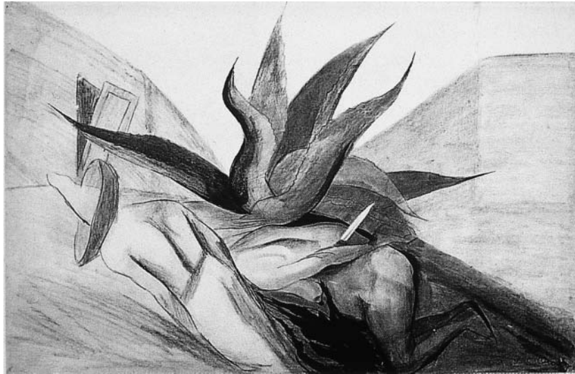
Figure 2. José Clemente Orozco, Battlefield No. 2, 1926-1928, ink and graphite on paper, 31.5 × 48.1 cm, Museo de Arte Alvar y Carmen de Carrillo Gil, México, D. F.

Among the drawings that most graphically display corporeal devastation are Mutilated and The Wounded , images of temporary field hospitals filled with disfigured and amputated soldiers. Piles of dead bodies abound in several other drawings. Battlefield No. 1 and Battlefield No. 2 each show two bodies at the bottom of a hill crowned by the image of a torn, ripped maguey plant. The bodies are so flat, they seem to be eviscerated of skeleton and bone, appearing as lumps of flesh lining the hill. Each drawing includes the form of a hat that sits in volumetric repose to the formless bodies.