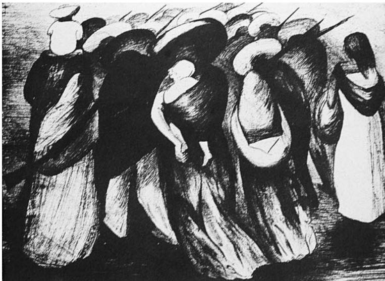
Figure 5. José Clemente Orozco, Requiem , 1928, lithograph, 31 × 40.5 cm, Museo de Arte Alvar y Carmen de Carrillo Gil, México, D. F. © Clemente Orozco V.